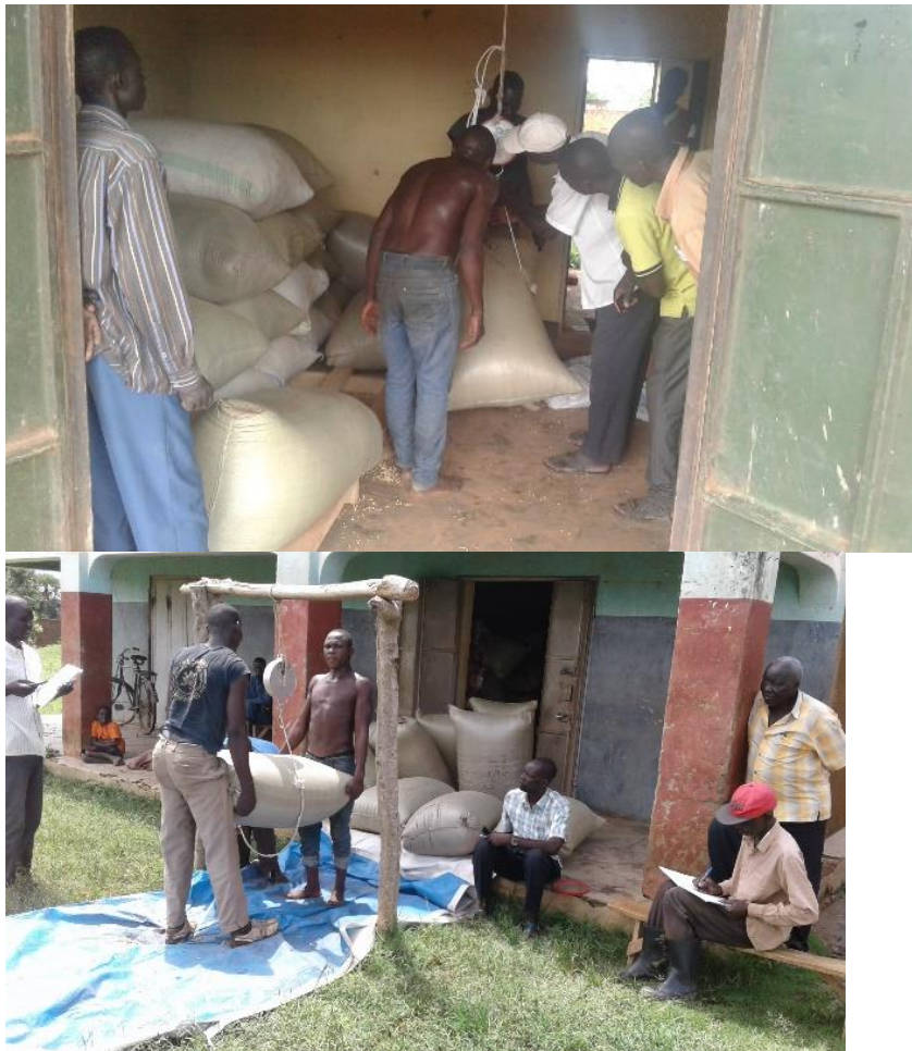
Small-scale farmers in Amolatar district selling their bulked produce at one of the community storage facilities