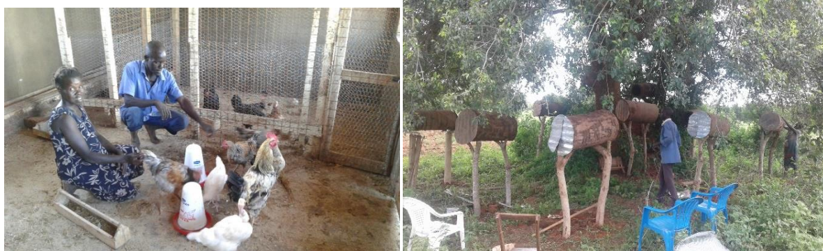
Managing director-Bedigen agro-ecology farm in Awelo Sub County, Amolatar district and her spouse in their poultry house and apiary respectively