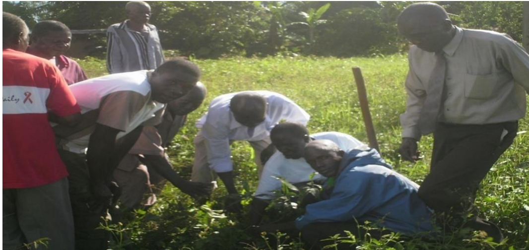
Local government and traditional leaders supporting a youth headed household demarcate Its family land in Barr subcounty, Lira district