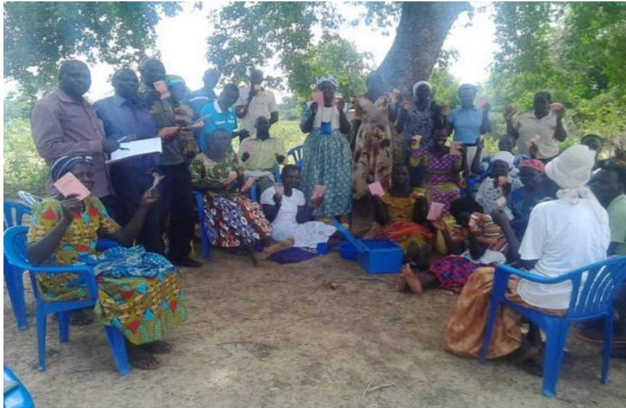
Farmer group participating in a VSLA session in Amolatar district