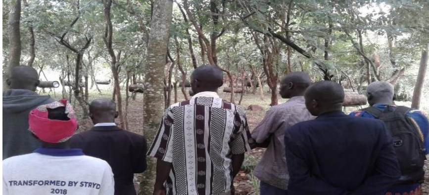
Lead farmers from Amolatar district during exposure visit to the apiary section in TAF farm-Ngetta