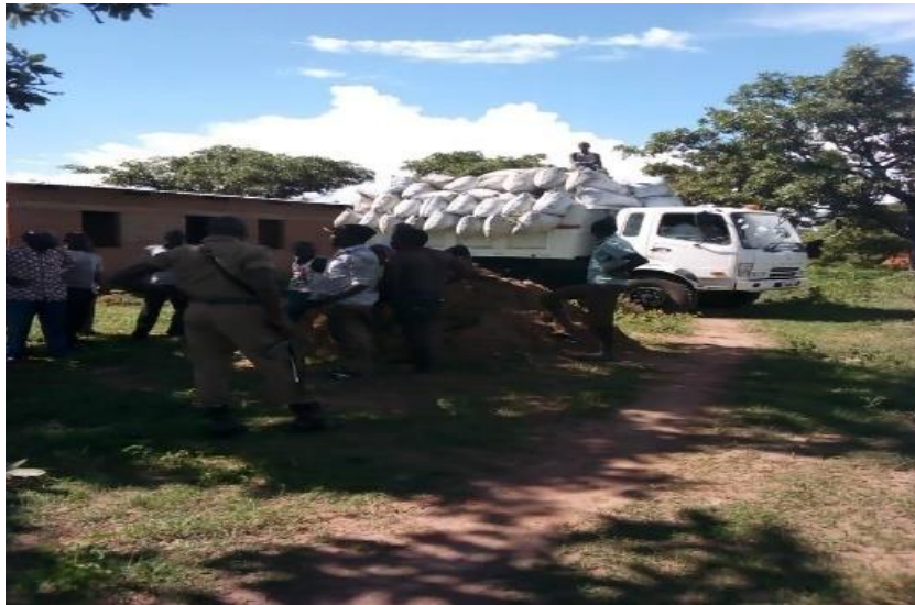
Illegal charcoal impounded and burnt to discourage unregulated charcoal trade in Otuke District